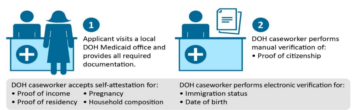
Figure 2: Medicaid Eligibility Determination Process

Figure 2 depicts Puerto Rico's process for determining whether an applicant is eligible for the Medicaid program and for redetermining the eligibility of individuals already enrolled in the program.<sup>8</sup> Redeterminations should be conducted every 12 months or when a change in a Medicaid beneficiary's circumstances impacts their eligibility.